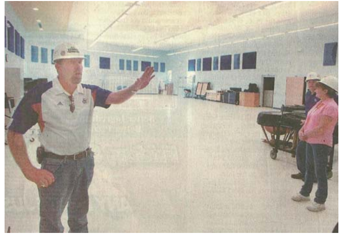
Contractor shares view of New Band Room on HS School Tour.

http://www.hutchnews.com/Todaystop/Holy-Cross--5