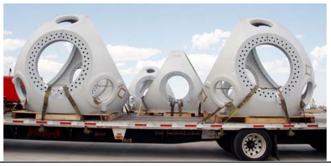
Wind Turbines arrive at Siemens:

http://www.hutchnews.com/Todaystop/SAT--siemens-on-sched--1