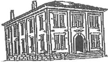
CLINTON TOWNSHIP HALL CIRCA 1939

172 W. Michigan Avenue P.O. Box G Clinton, Michigan 49236