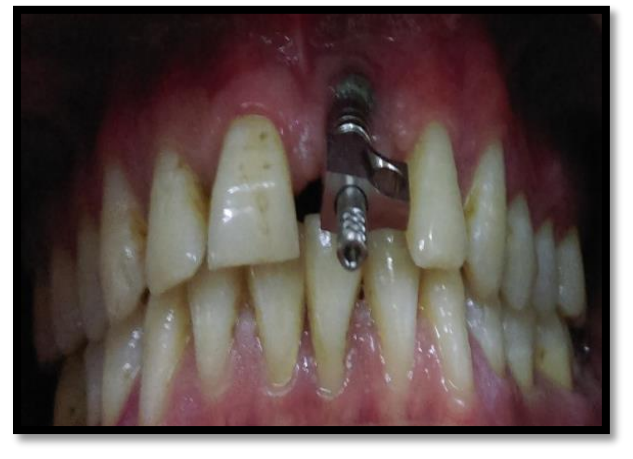
Fig-4: Intraoral view showing impression copings