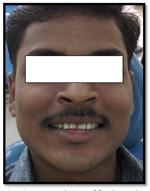
Fig-16: Extra oral view of final prosthesis