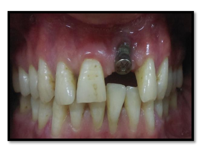
Fig-3: Intraoral view showing healing abutment