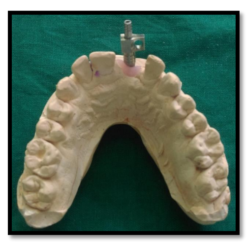
Fig-6: showing labially oriented Impression copings