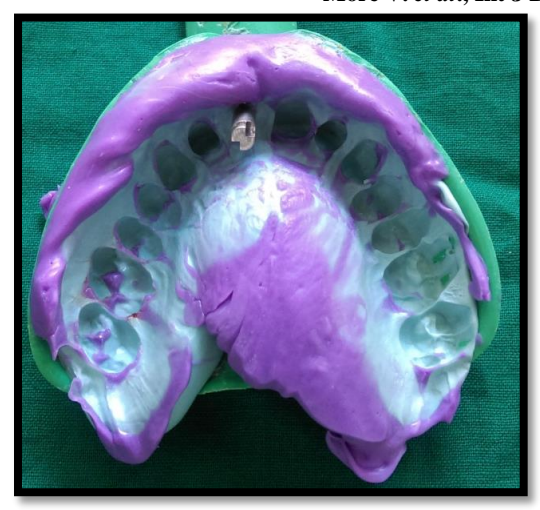
Fig-5:Impression with lab analogue