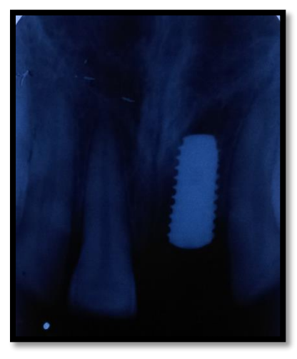
Fig-1: Radiograph showing implant in 21 region