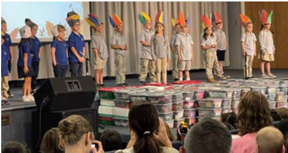
Left and below: Kindergarten Chapel