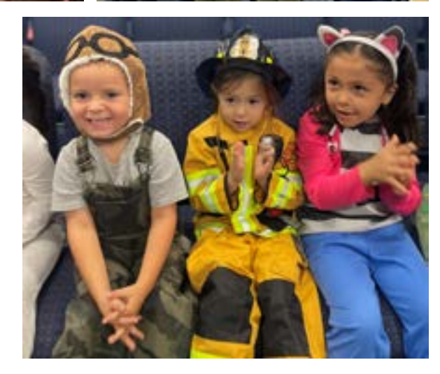
Book Character Day