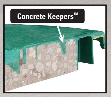
Holds up to 70 lbs of Concrete for Added Safety.