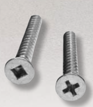
1.75" phillips drive