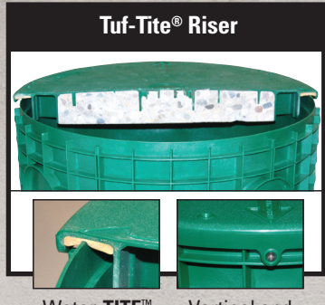
Water-TITE™ Vertical and Horizontal Safety Screws