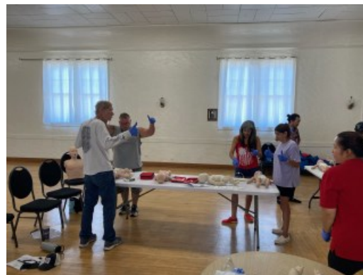
Last month's CPR/AED training and certification class at Post 132 in Orange.