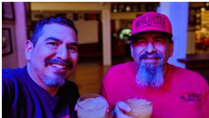
My very first time setting foot inside Post 132, in March 2019.