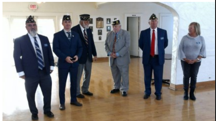
Incoming 2024/2025 Legionnaire officers about to be sworn in.

As we go into another Legion year, we look forward to the events we are having at our Post. One in particular that I'd like to mention is that our Post will be the headquarters for the American Legion State Baseball Tournament . The tournament will be from July 24th-29th, and we'll be serving breakfast and dinner each day, so we can definitely use your help. There's a sign-up sheet at the Post club room.