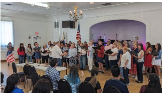
Post 132 served as one of the host venues for World Make Music Day, with celebrations throughout Orange.