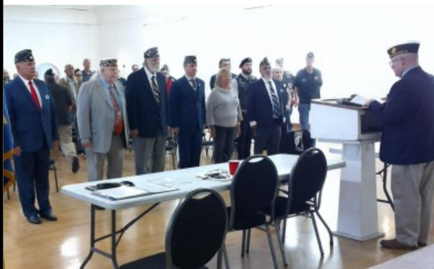
Legionnaires get sworn in at the Installation of Officers on our June 13 general meeting.