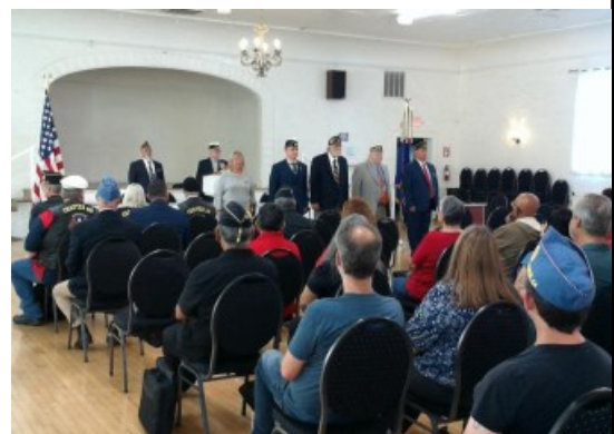
2024/2025 Installation of Officers on June 13.