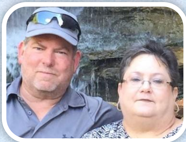
Roger & Susan Foxhall San Antonio, TX

No photo available - we hope to see you at a future rally or mini-rally!