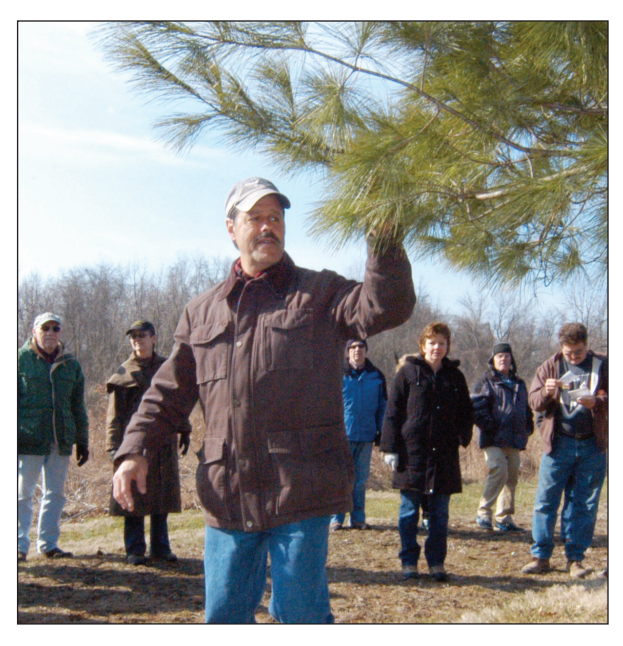
Association members enjoy field trips on a variety of subjects where conservation is stressed.

We extend an invitation to all of you who are interested in learning about and promoting high standards of woodlot management practices. Your participation will add diversity to the forum of ideas and woodlands related issues provided by the members.