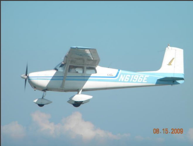
Anthony's first airplane, a Cessna 172, N6196E in the air over Culpeper, Virginia