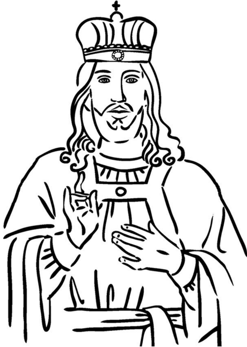
Christ the King John 18:33-37

Each number represents a letter of the alphabet. Substitute the correct letter for the numbers to reveal the coded words.