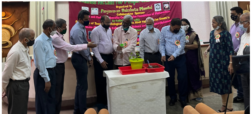
DIGNITARIES PLANTING TULSI SAPLING