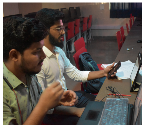
PARTICIPATED STUDENTS PRESENTING THEIR RESEARCH PAPER IN RESEACH PAPER COMPETITION (GROUP B)