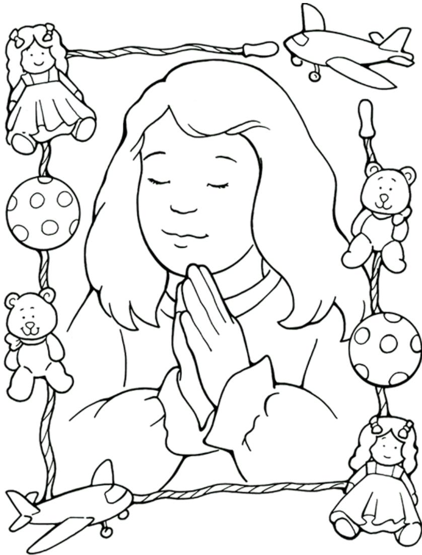
Keep on Praying

Each number represents a letter of the alphabet. Substitute the correct letter for the numbers to reveal the coded words.