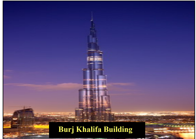
Burj Khalifa Building

In conclusion, be wise by being obedient to the Word of God, work on these foundations, stand on these foundations and 2013 shall be a year of years for you in Jesus name. Remember Proverbs 9:12 says: If thou be wise, thou shalt be wise for thyself: but if thou scornest, thou alone shalt bear it . Proverbs 9:12 You are the one who will profit if you have wisdom, and if you reject it, you are the one who will suffer. Proverbs 9:10 Fear of the LORD is the foundation of wisdom. Knowledge of the Holy One results in good judgment.