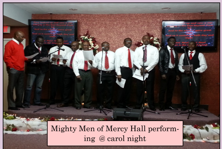
Mighty Men of Mercy Hall performing @ carol night