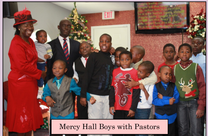
Mercy Hall Boys with Pastors