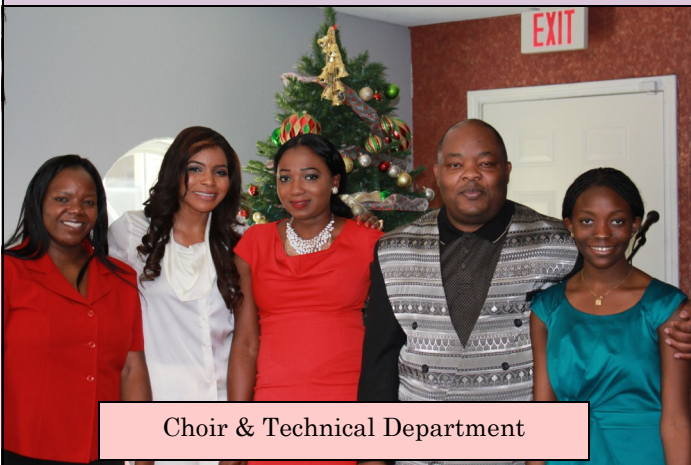
Choir &amp; Technical Department