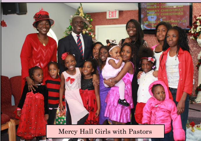
Mercy Hall Girls with Pastors