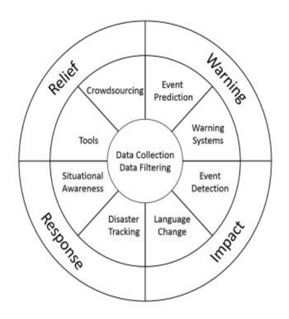
Fig. 1. Social-temporary stages in social media incidents [2]