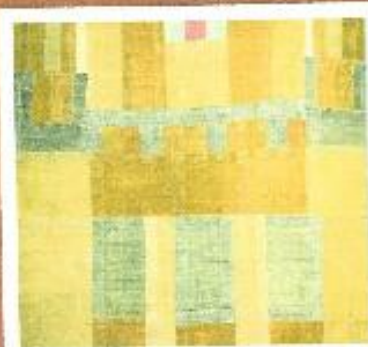
CLOSE-UP OF BOJAGI