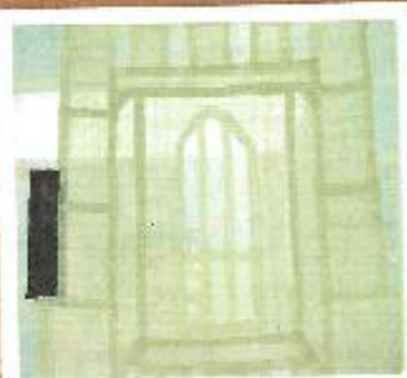
BIRMINGHAM SHOW PTECE

care was believed to bring good luck and happiness. Thus, it seems that making a great effort to patch together the scraps of cloth was regarded as a medium for asking for good luck. In addition, connecting small pieces of cloths was associated with long life.