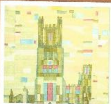
CHURCH IN ENGLAND