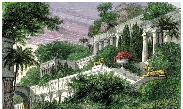
Depiction of the Hanging Gardens of Babylon