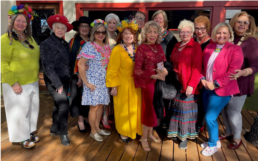
The Fine Art's Round Table met at Nicha's for a festive lunch.