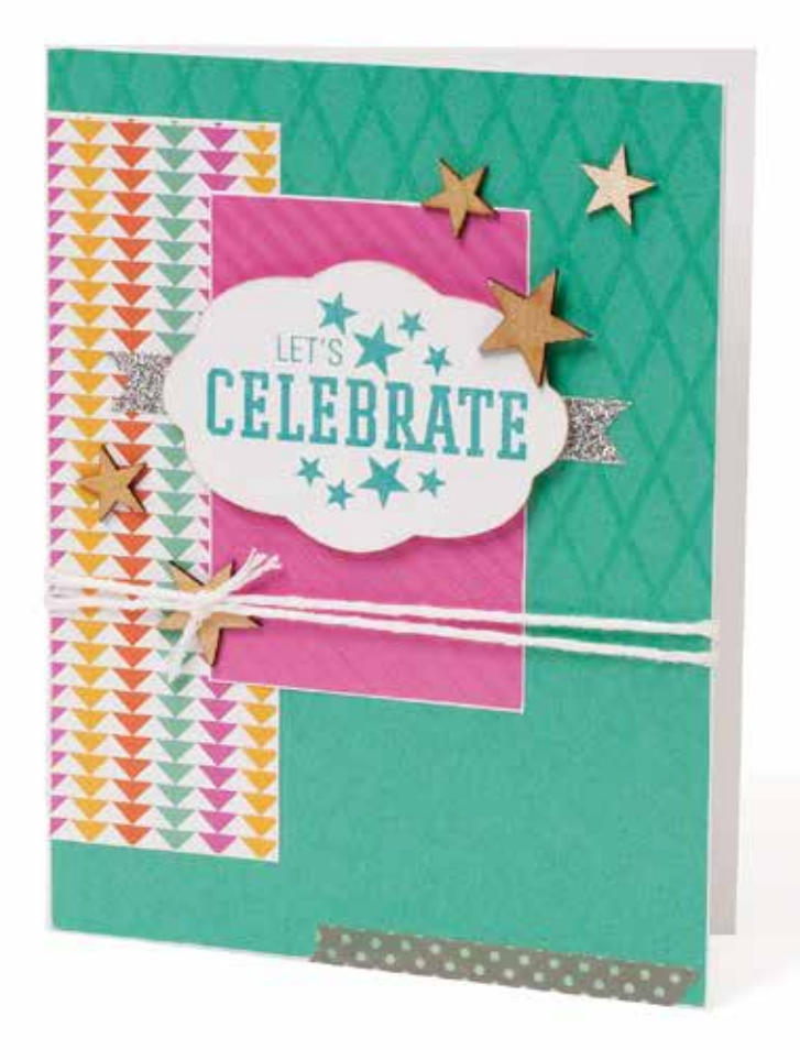
5\frac{1}{2} " × 4\frac{1}{4} " LET'S CELEBRATE CARD

Originals: Winning Combination<sup>™</sup>