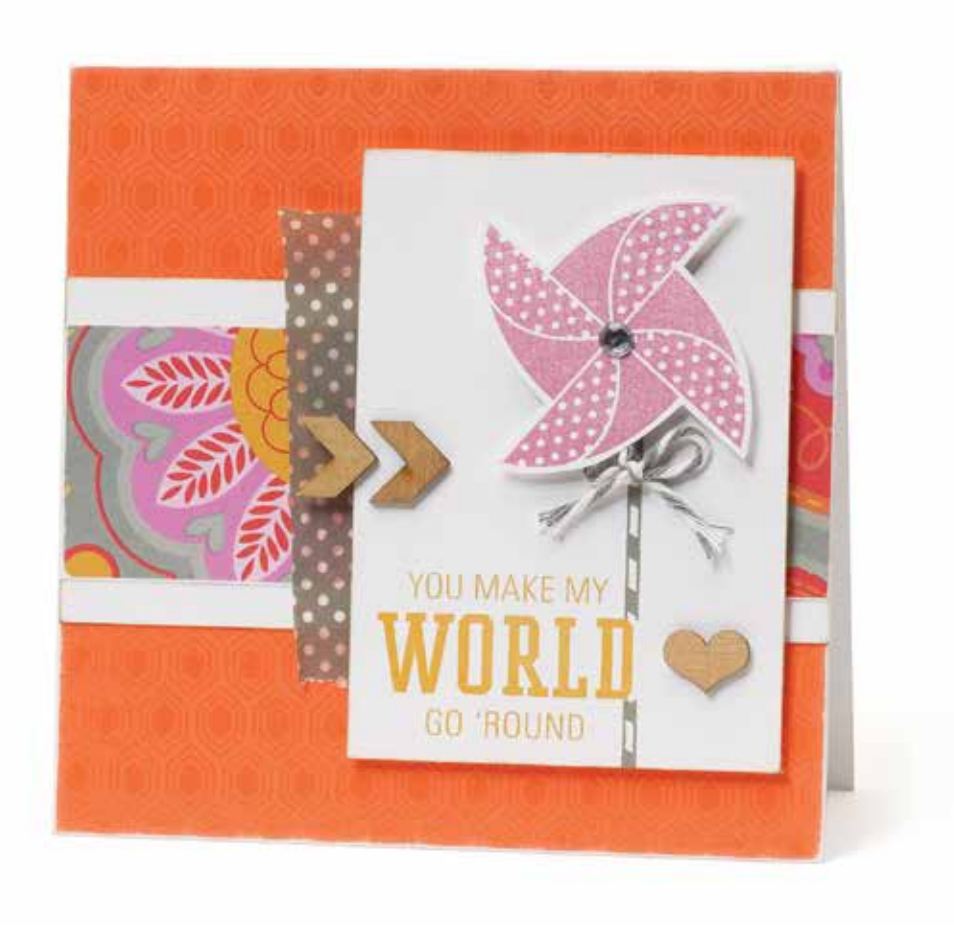
4\frac{1}{2} " × 4\frac{1}{2} " WORLD GO 'ROUND CARD Wishes: Just Right™