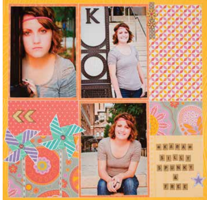
12" × 12" LIVE OUT LOUD LAYOUT