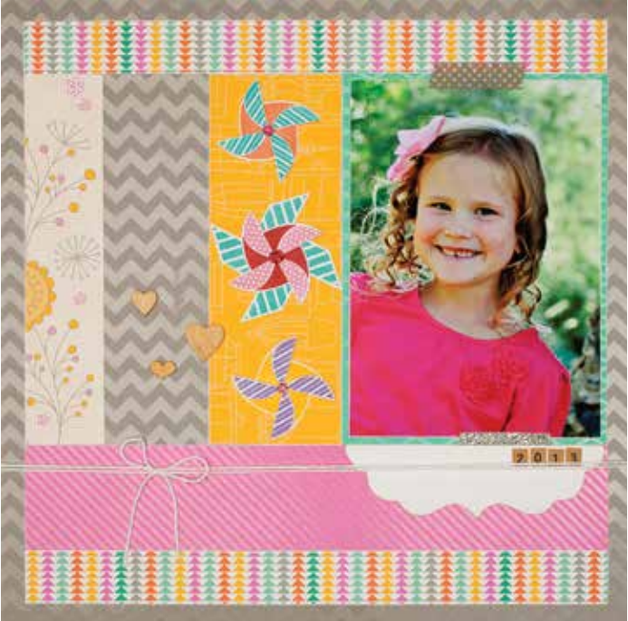
12" × 12" SWEETNESS LAYOUT