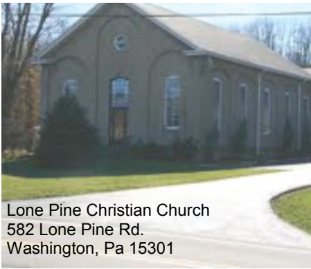
Lone Pine Christian Church 582 Lone Pine Rd. Washington, Pa 15301