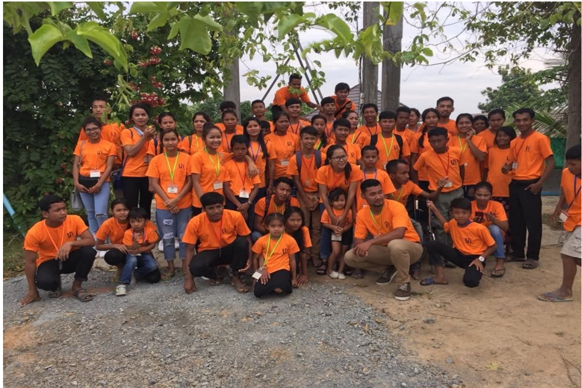
Church Camp Attendees