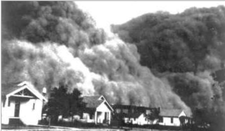
Photograph of dust cloud enveloping neighborhood, 1933

“Let the workers organize. Let the toilers assemble. Let their crystallized voice proclaim their injustices and demand their privileges. Let all thoughtful citizens sustain them, for the future of Labor is the future of America.”