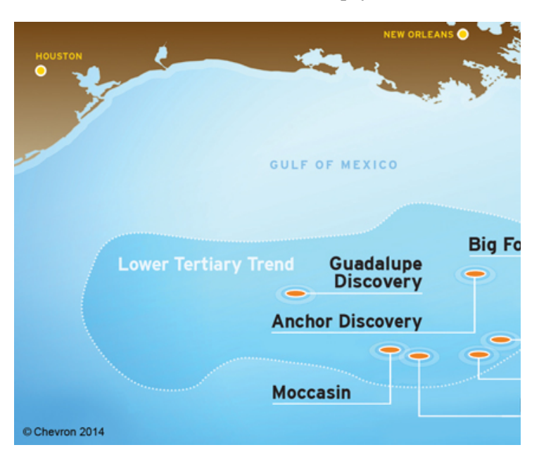
Anchor is located approximately 140 miles (225 km) off the coast of Louisiana.

The original Anchor discovery well, located in Green Canyon Block 807, approximately 140 miles (225 km) off the coast of Louisiana in 5,180 feet of water (1,579 m), was drilled in late 2014 to a depth of 33,750 feet (10,287 m) and it encountered 690 feet (210 m) of net oil pay.