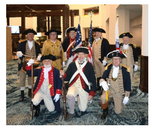
AZSSAR Color Guard at the Board of Managers meeting February 13, 2022

Thanks to all the businesses and individuals that sponsored the Prescott Chapter during 2021 by providing money, items for the silent auction or for not charging for use of facilities.