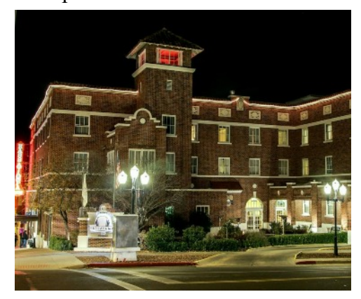
Lunch at the Hassayampa Inn every second Saturday of the month.