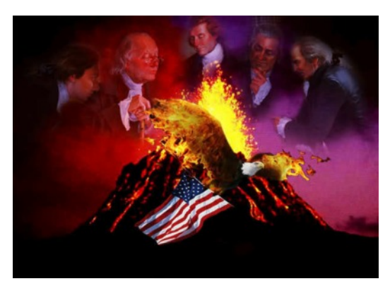
What would the Founders think of our country today?