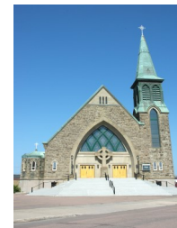
Saint Augustine's 340 Dominion Street Moncton, NB E1C 6H8

December 8th, 2019 Second Sunday of Advent