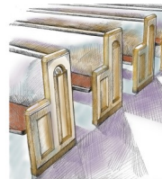
News from the Pews