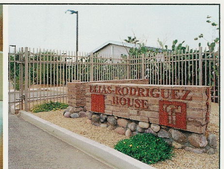
Elias Rodriguez House - Tempe, Arizona