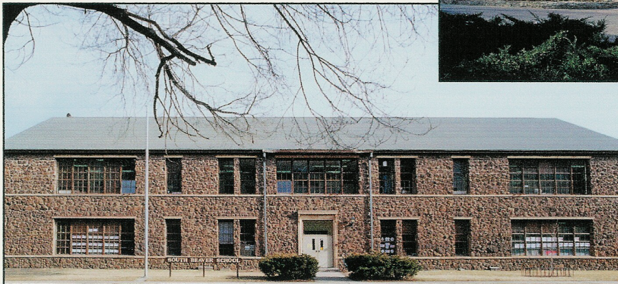
Beaver School Flagstaff, Arizona

"It is my pleasure to recognize Lejas Corporation on behalf of the Development Services Department for exemplary construction work and outstanding customer service provided to the City of Tempe for the Elias Rodriguez House Rehabilitation Project. The quality and professionalism that Lejas Corporation brought to this difficult endeavor greatly added to the overall success of this award-winning project."