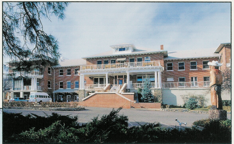
Arizona Pioneer Home Prescott, Arizona