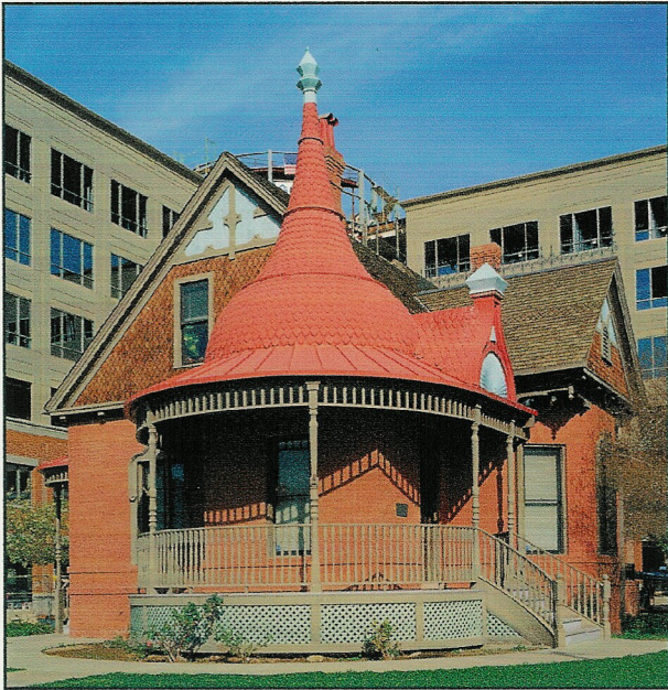
Evans House Phoenix, Arizona