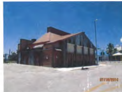
Image of Structure