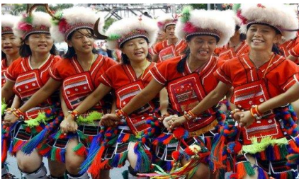
Indigenous girls singing and dancing in a traditional festival 原住民在傳統節慶中歌舞

台灣原住民因長期缺乏政府照顧，資源匱乏，屬於弱勢族群，許多人酒精中毒。所幸，近年因積極發展旅遊業，使其經濟得到改善，並以擁有其原住民文化為榮。