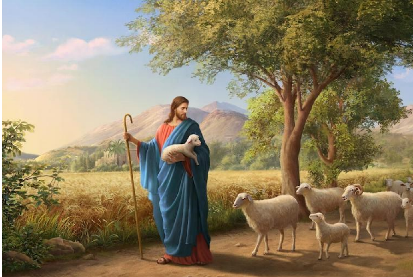
April 21, 2024