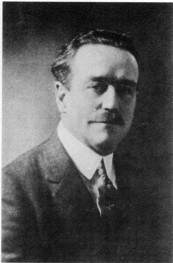
EVANGELIST CHARLES FOX PARHAM