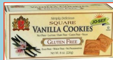
8oz. Vanilla Cookie Squares