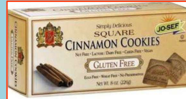
8oz. Cinnamon Cookie Squares