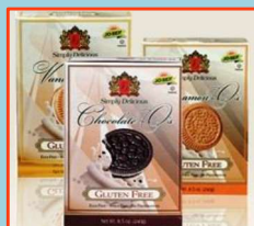
Our 8.5-oz. Sandwich O's In 3 Delicious Flavors