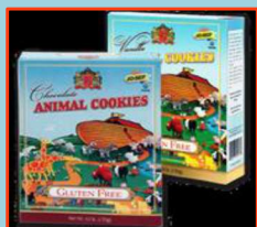
Animal Cookies In Chocolate & Vanilla