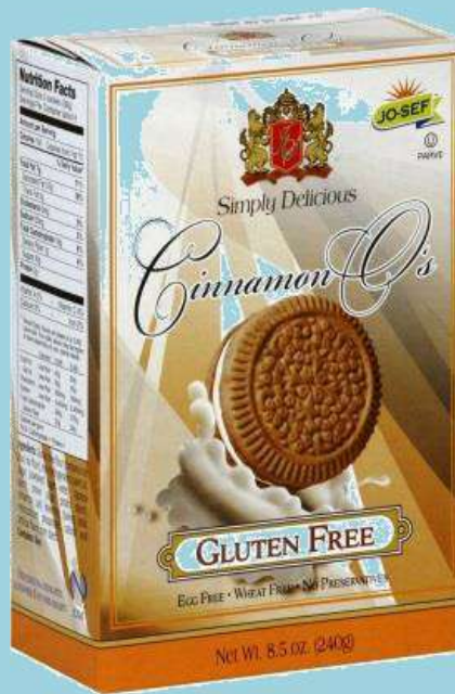
8.5-oz. Sandwich O's In Chocolate, Vanilla & Cinnamon