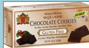
8oz. Chocolate Cookie Squares