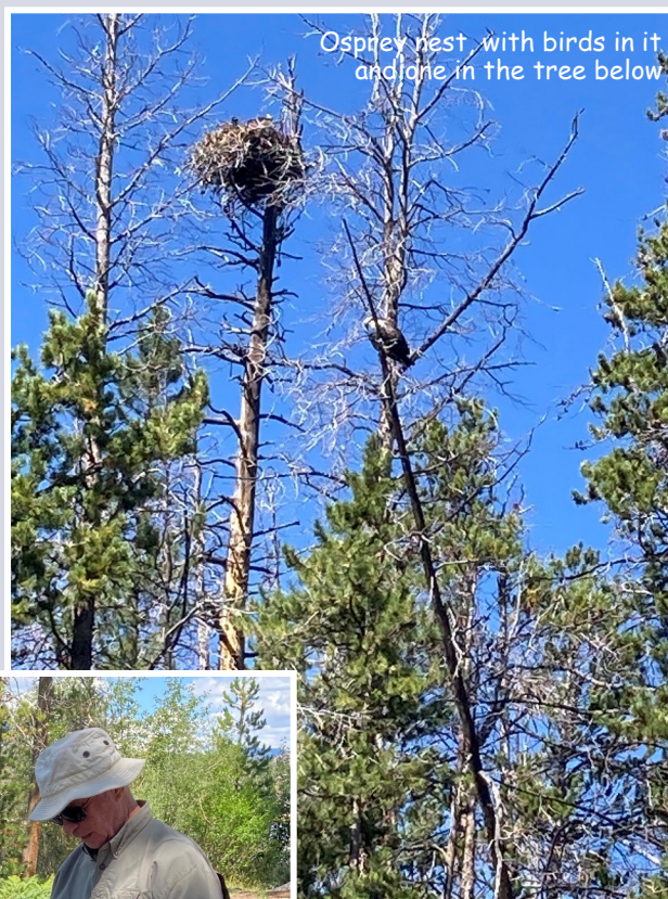
Osprey nest with birds in it and one in the tree below

"We had lunch at the little park where the Colorado River comes in. There is a picnic table in dappled shade, it was very pleasant. I think it was Pine Beach area [C], just closer to the inlet. After lunch we paddled back to the take out."