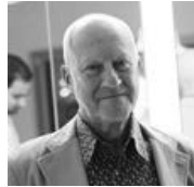
Sir Norman Foster