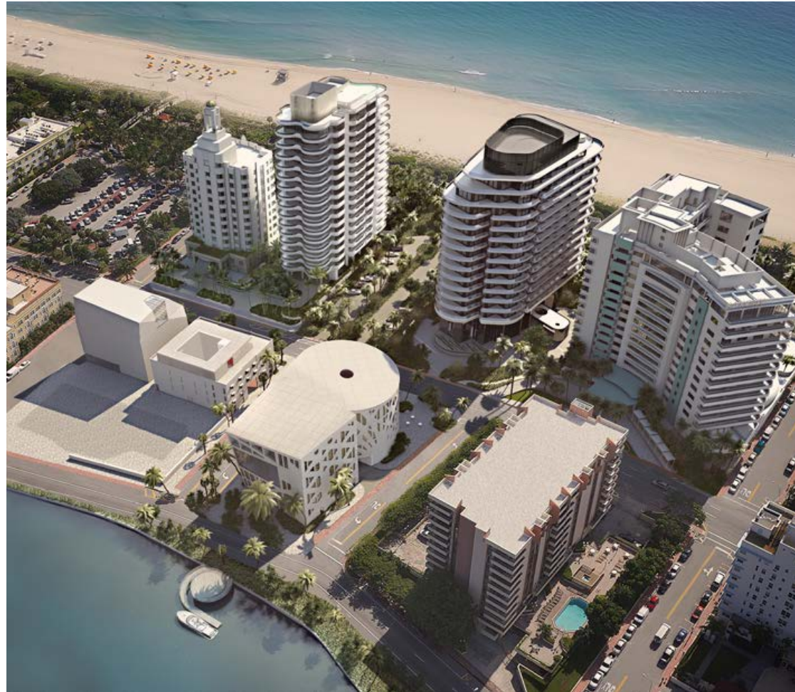
On the Ocean and 35th Street