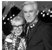
Baz Luhrmann and Catherine Martin