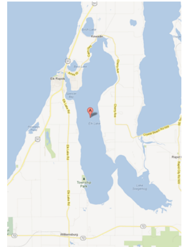
ELK LAKE, MI