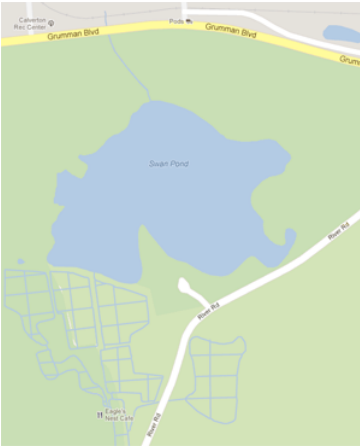
SWAN POND, L.I.