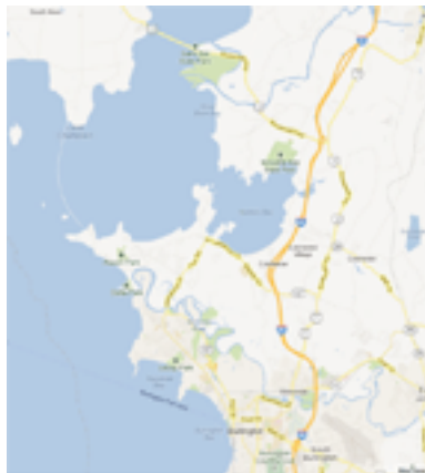
MALLETTS BAY, VT