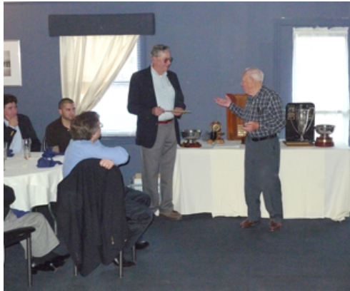
Last Years Awards Dinner