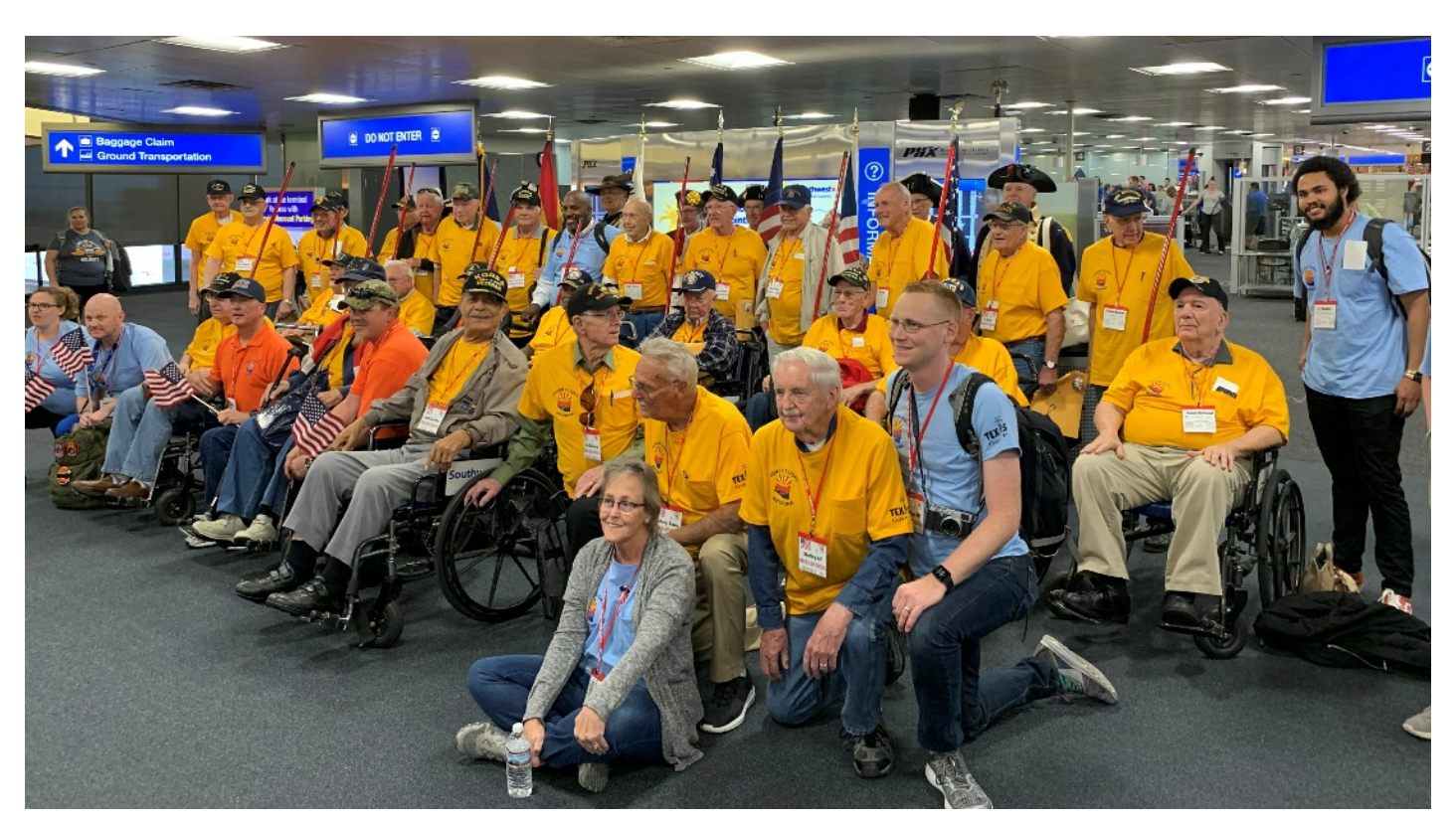
WWII and Korean Veterans welcomed home after their Honor Flight April 18