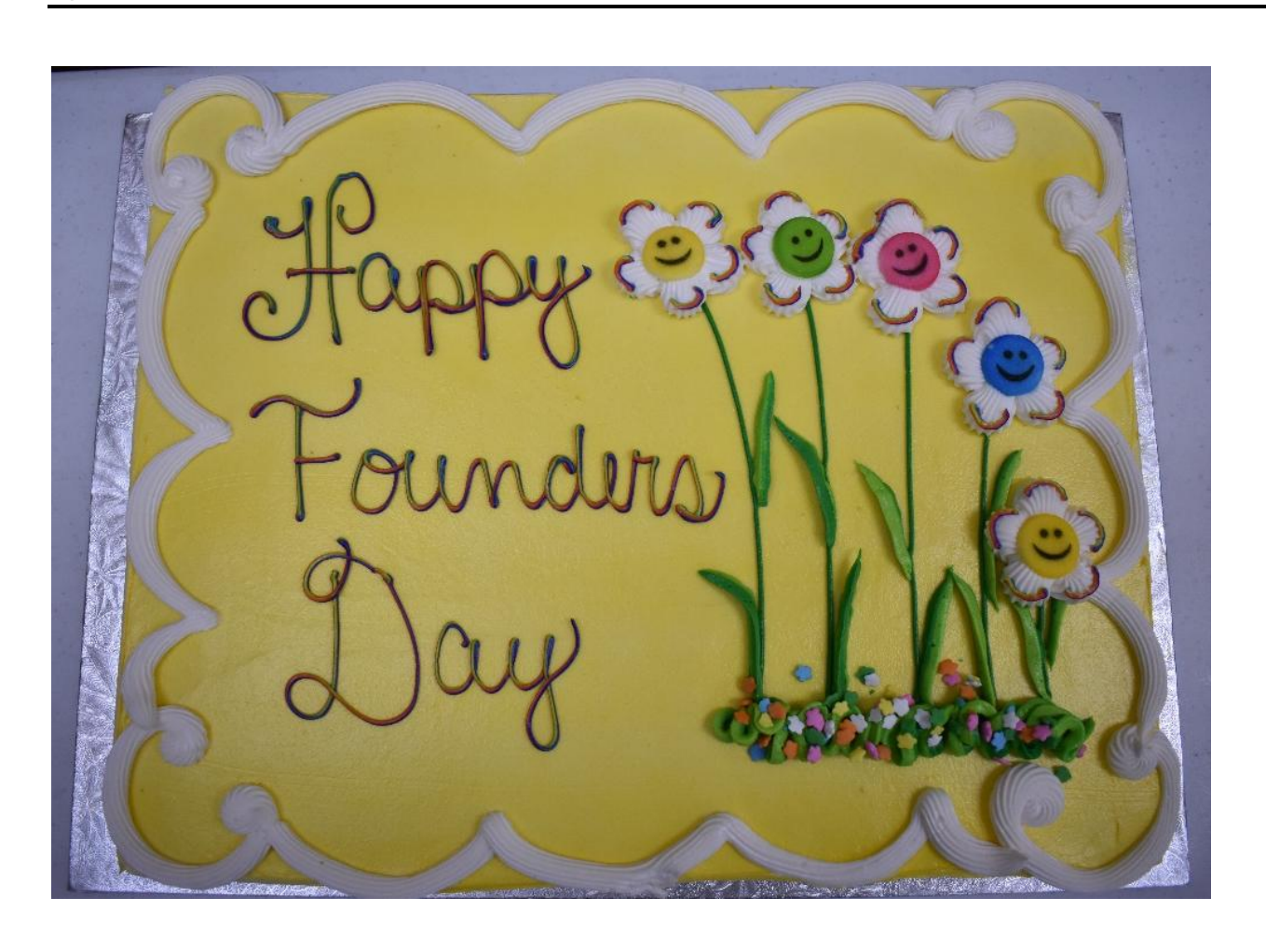
Happy (belated) Founders Day