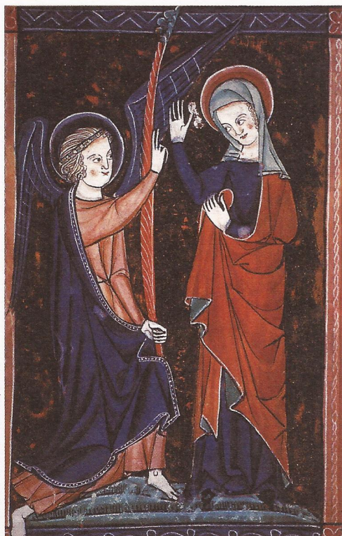
THE ANNUNCIATION / PSALTER, VENICE

P erhaps God has already spoken to you! In the great calls in Scripture, God doesn't seem to care about age. God doesn't care about gender, race, talents, poverty or wealth, strengths or weaknesses. God calls each of us because we are God's daughters and sons. God's call is personal (to you and no other!), and this call is to always be Christian and serve the Lord. Most often