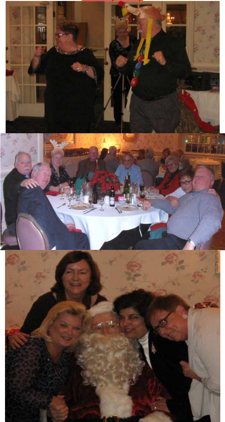
Everyone loves Santa