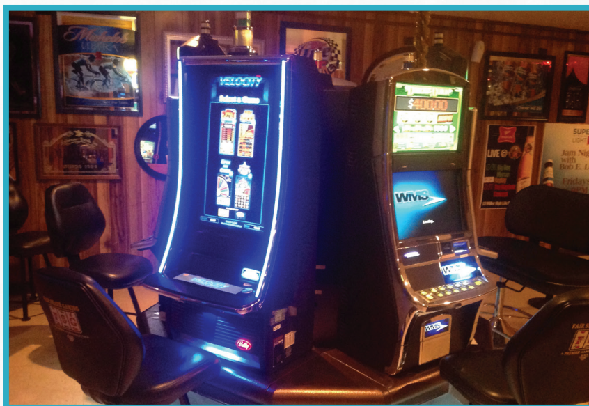
Unique carousel design in J Martin's Tap, Steger, IL