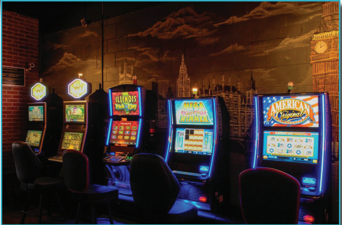
Duett Bar in Justice