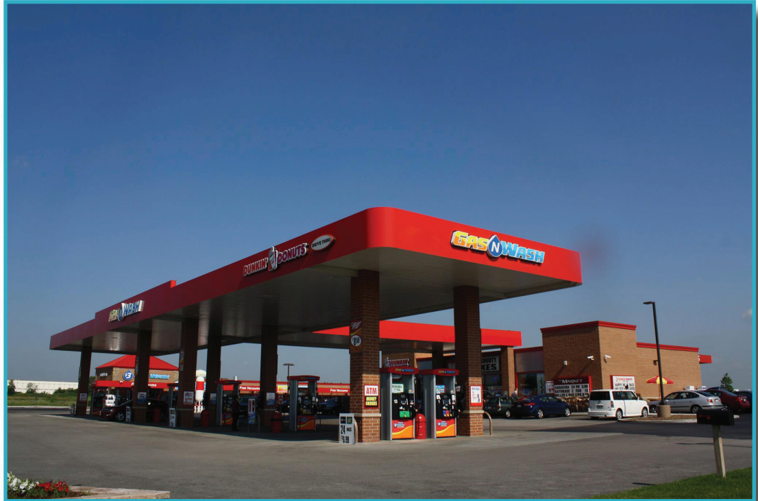
Lenny's Gas N Wash, Mokena, IL

Fair Share Gaming made the entire procedure painless from the first meeting through the paperwork process to design and installation with the Gaming Board. Everything has been handled efficiently and professionally from beginning to end. I know my profits the next morning on the 1st and 16th like clockwork. Fair Share is very well respected in the industry by their peers and state officials I have spoken with.