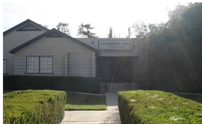
Front and side views of the Veterans Hall

The LVHS has several artifacts from Post N. 330, which it hopes to display at the Veterans Hall in one of our new display cases. The Veterans Hall is the site of many city-sponsored activities. On December 14, 2018, at 5:00pm., join the LVHS at the Veterans Hall for its holiday potluck and silent auction.