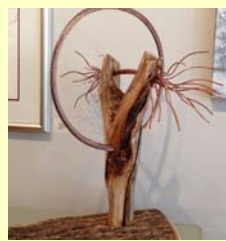
Sculpture by Jim Greene