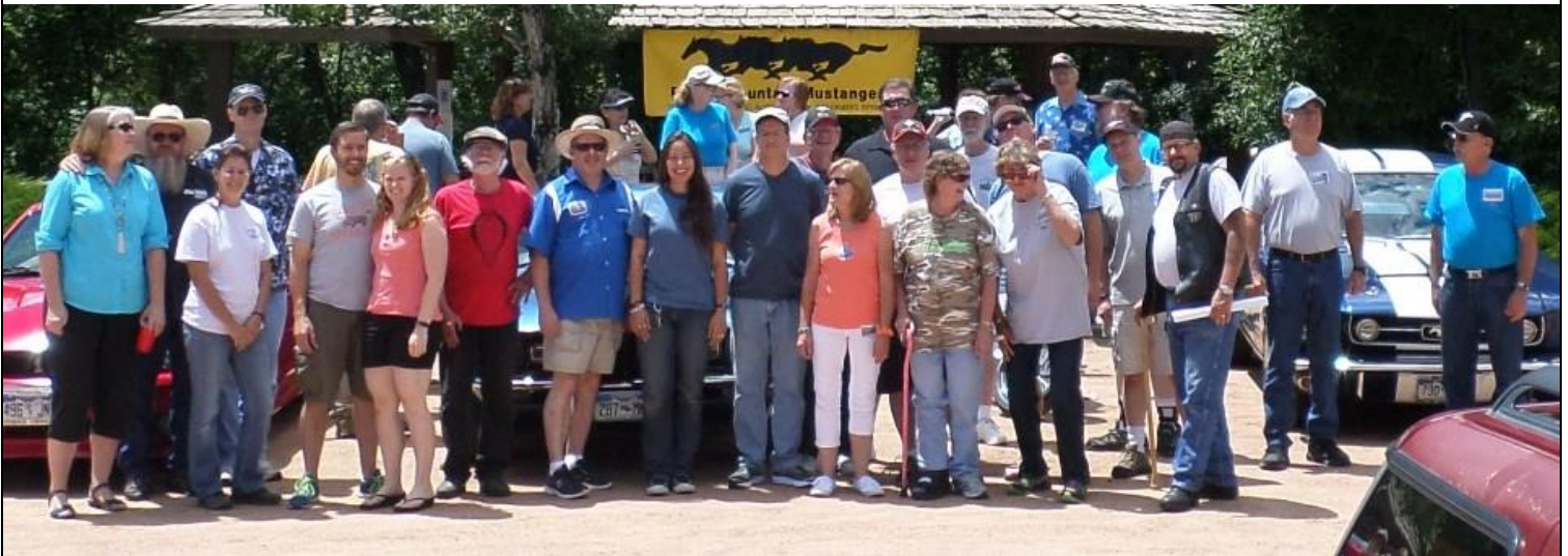
Club Picnic Attendees, People

September means the Fall Colors Tour time is fast approaching so make sure to get out and enjoy the rest of the summer in your Mustang - cruising, showing, racing or out in the garage. New or old, always Mustang! http://www.ford.com/cars/mustang/?intcmp=hp-none-brand-gallery