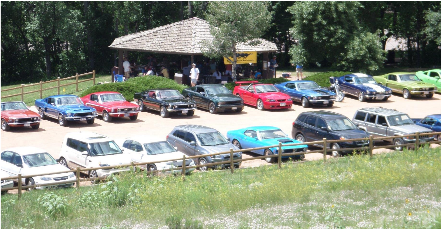
Club Picnic Attendees, Cars