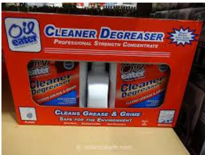
Oil Eater and Electric Water Heater Element

Sure enough, when heated, Oil Eater easily melts away grease and grime. It's also quite nice to have heated solvent when cleaning parts on a frigid morning in February.