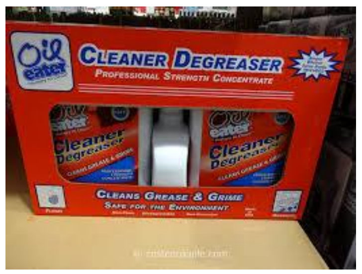
Oil Eater and Electric Water Heater Element

Sure enough, when heated, Oil Eater easily melts away grease and grime. It's also quite nice to have heated solvent when cleaning parts on a frigid morning in February.