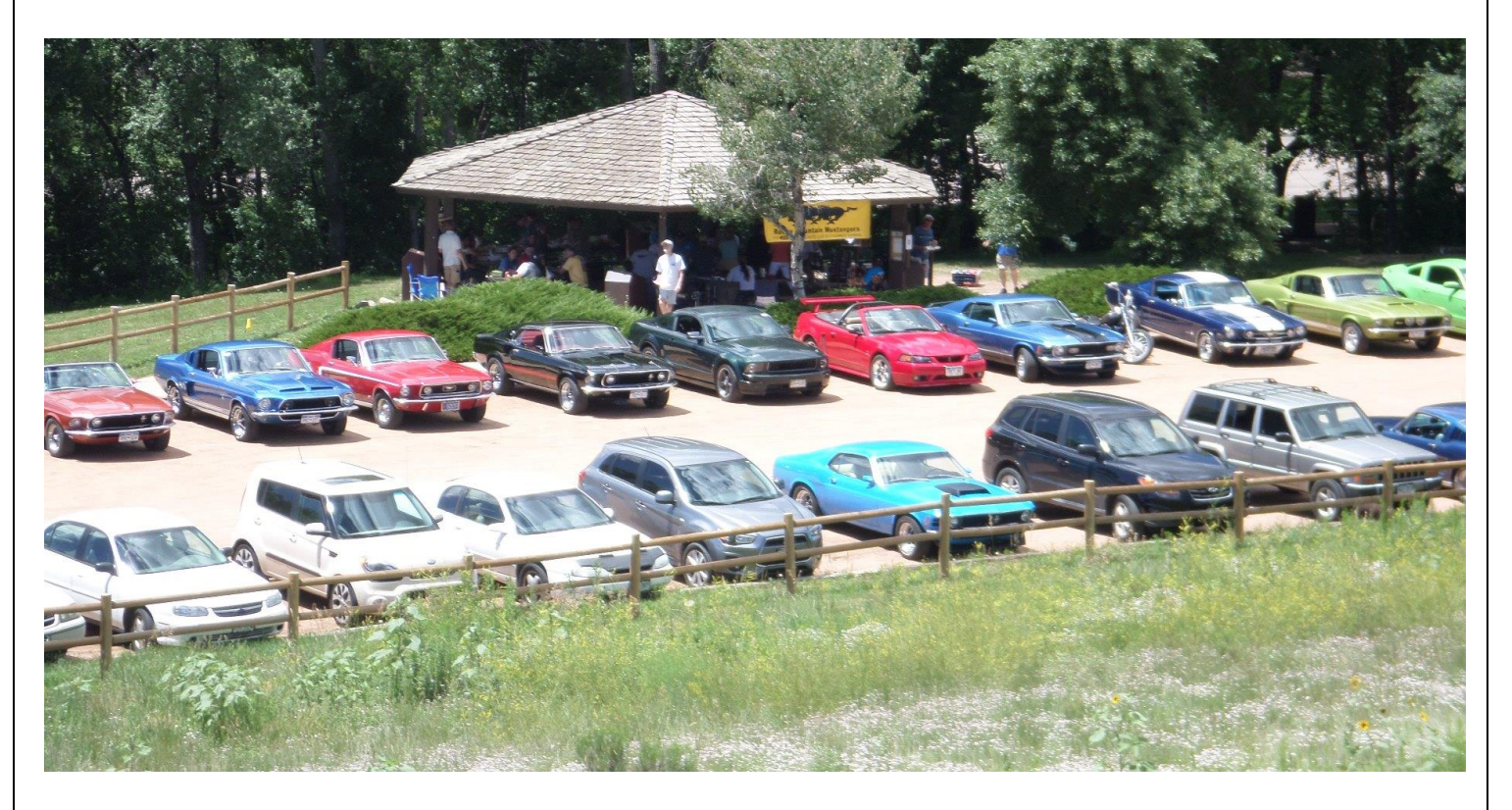
Club Picnic Attendees, Cars