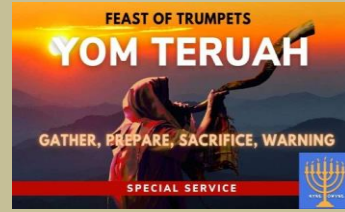
Rosh Hashanah, Monday Night Tuesday, Sep 23