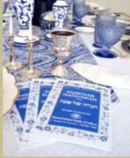
Seder: Saturday Night, April 12