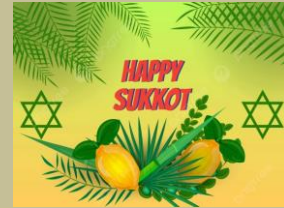
Monday Night Tuesday, Oct 7 Monday Night Tuesday Oct 14