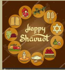
Sunday night Monday June 2