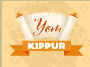
Wed. Night Thursday Oct 2