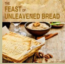
Sunday, April 13 Saturday, April 19