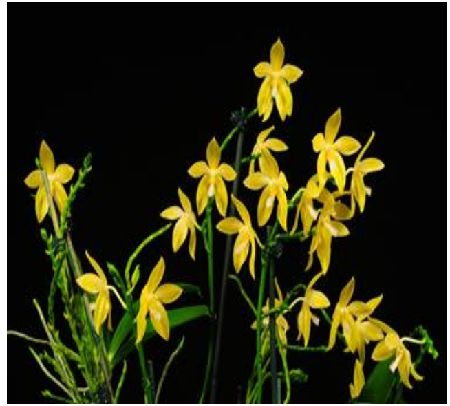
Phal hieroglyphica alba Award of the Month from October