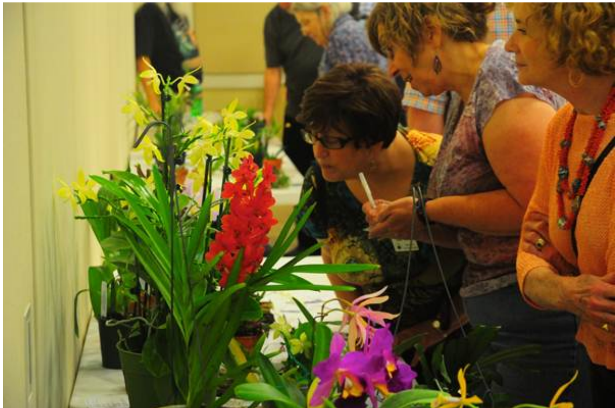
Show and Tell viewing and judging