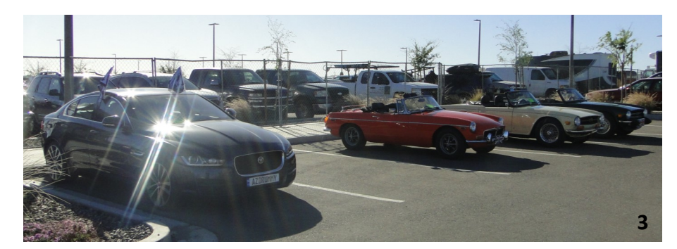
Photos 2, 3 & 4— Cars got to park in different places so they won't so spread out and closer together.