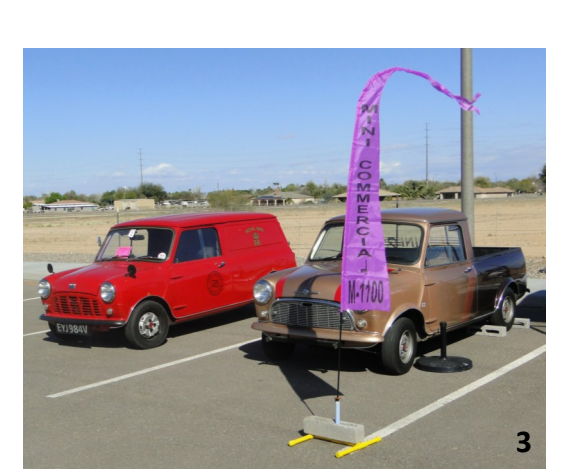
Photo 3- "Oscar" & the "Lil Pick-em-up" in the Mini Commercial class Photo 5- "Elvis" being the only Modern MINI was in the One of a Kind class with a Bentley.