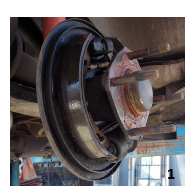
Photo 1— Found the reason that the rear brakes kept locking up, the wheel cylinder had gone out.

Photo 2– Setting the timing on "Bertie", also checked the timing on "Gertie" as well.