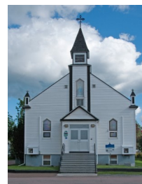
Our Lady of Mercy 11 St. Andrews Street Pointe-du-Chêne, NB