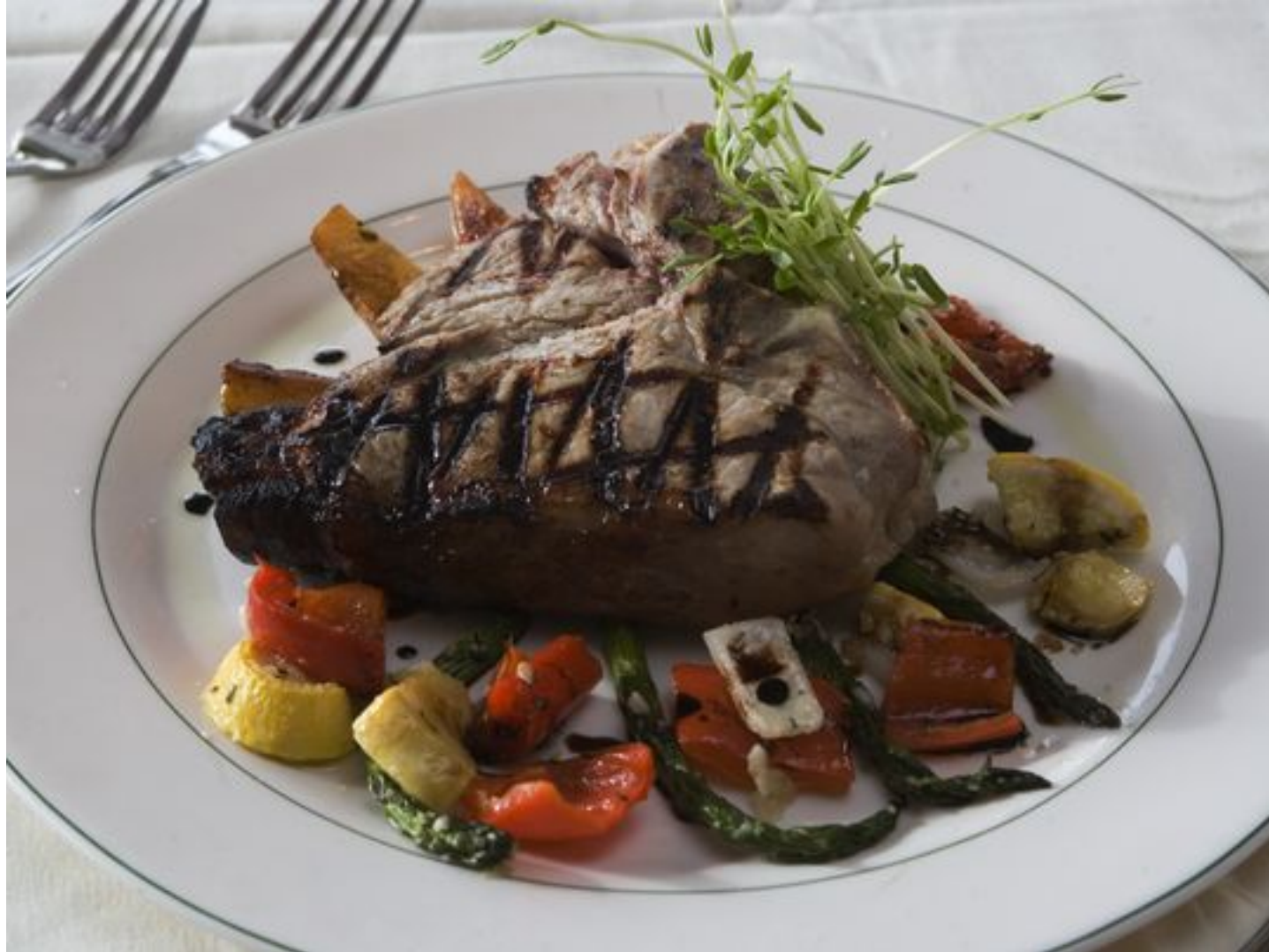
Charbroiled Veal Porterhouse Steak, as served by Bisque in Ship Bottom.

You can't go wrong with a crowd-pleaser like Moonstruck , 517 Lake Ave., Asbury Park. The American-Mediterranean restaurant has stood the test of time, celebrating its 21st anniversary in 2016. Originally in Ocean Grove, Moonstruck moved to Asbury Park in 2002, taking over a multistory Victorian-style building, loaded with windows and wrap-around porches. It's always hopping.