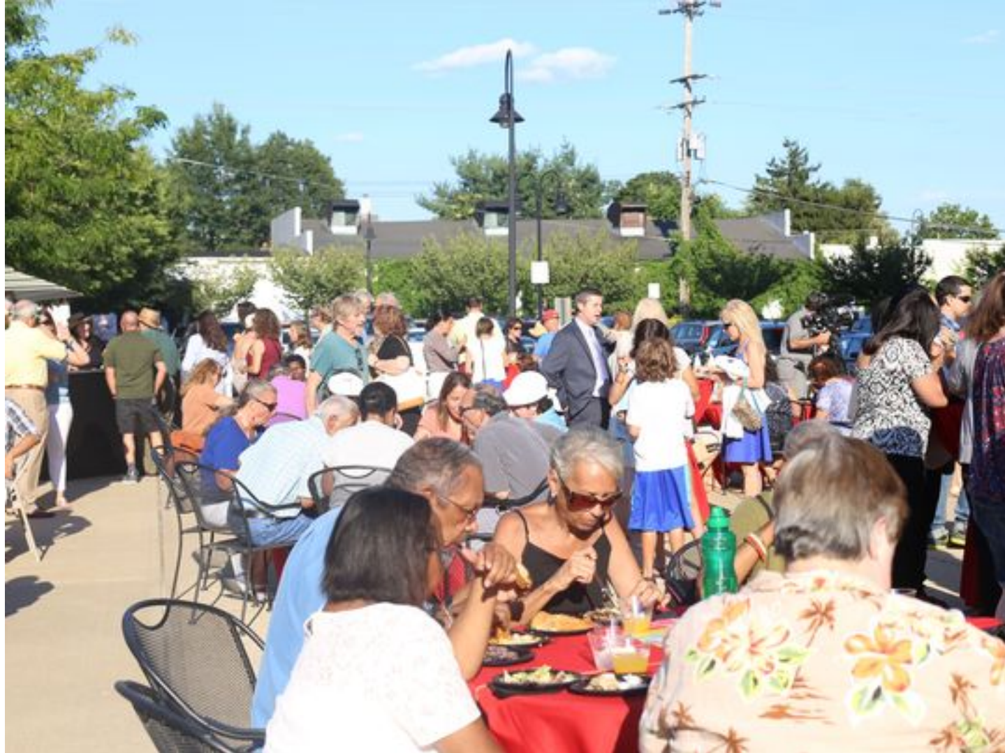
The 2015 Crossing Borders festival at Two River Theater in Red Bank kicked off with a party.

Crossing Borders , a festival of new plays by Latino writers, has become a tradition at Two River Theater in Red Bank over the past five years. This year's festival, scheduled for Aug. 3 through 7, is curated by Stephanie Ybarra, director of special artistic projects at The Public Theater in New York.