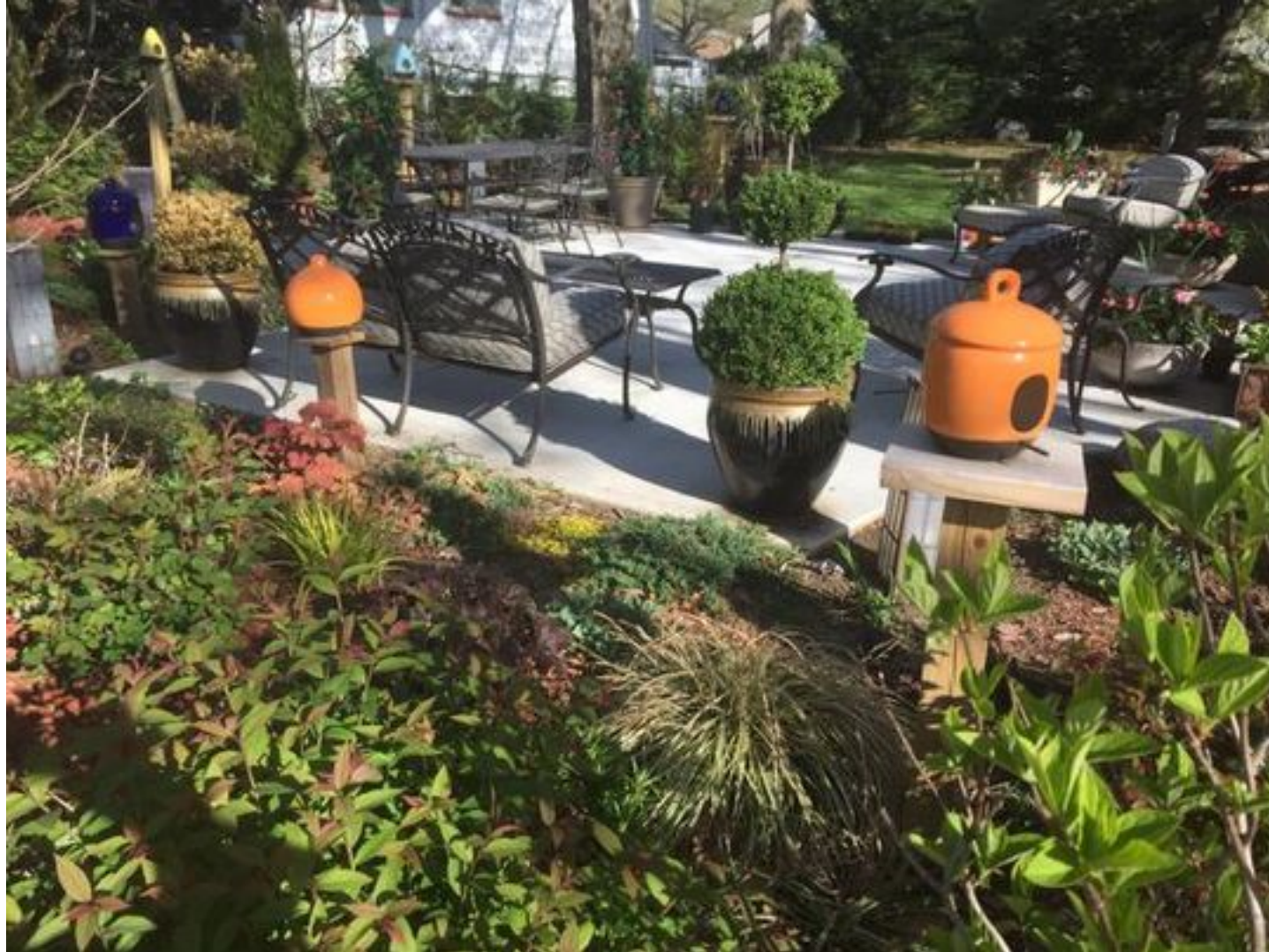
This garden on Broad Street has been featured in the Keyport Garden Walk.

Keyport Garden Walk , 11 a.m. to 3 p.m., June 4 and 5. Garden talks begin at 9:30 a.m. in Keyport Borough Hall, 70 West Front St. Scheduled programs are "Sizzling Summer Bulbs," by Judy Glattstein on June 4; and "Great Garden Day Trips For Your Hort Bucket List" by P. Steven Kristoph on June 5. Stroll or bike through this self-guided tour and discover more than 40 perennial gardens in charming neighborhoods, plus the Elizabeth Street Community Garden garden and the environmentally beneficial rain gardens along Keyport's magnificent waterfront. Admission is free. For info, call 732-687-9519 or go to keyportgardenwalk.org .