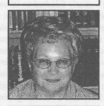
THELMA LONG GENERAL EPISTLES HEBREWS