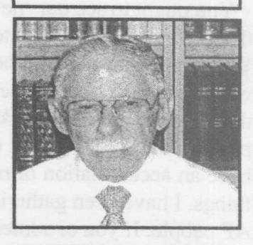
LOWELL LONG PAULINE EPISTLES HOMILETICS PROBLEM SOLVING